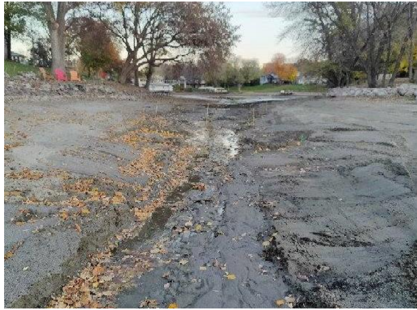
View from lake looking into bay