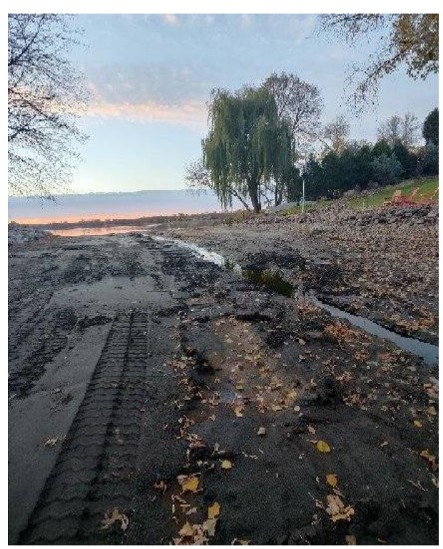
View from bay looking out to lake

Channel Dredging: Unfortunately, the channel connecting the boat ramp bay to the lake has eroded wider and shallower over the decades. The drawdown provided a great opportunity to dredge the channel to the same depth as the bay and stabilize the shore with riprap. The area was surveyed for a Minnesota DNR dredging permit and George Patras of Three Dogs Trucking hauled away approximately 133 cubic yards of material by truck; mostly from the shallower lake-end of the channel. The channel cross sectional profile was modified to a flat bottom with sloping sides that meet the 3:1 DNR recommendation for reasonable erosion stability. A bit of rain after the dredging created a tiny "trickle trench" down the entire length of the channel, demonstrating the dredged channel is now indeed as deep as the bay!