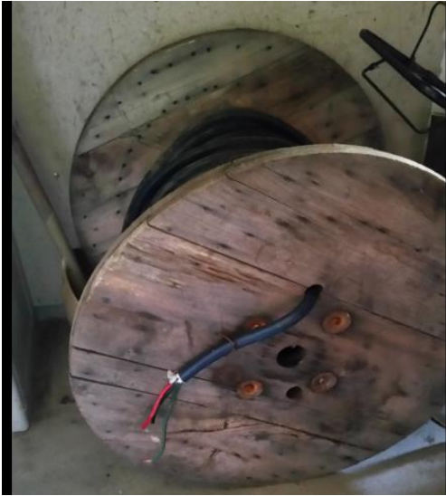
Aerator cable/drum (approximately 350' length)