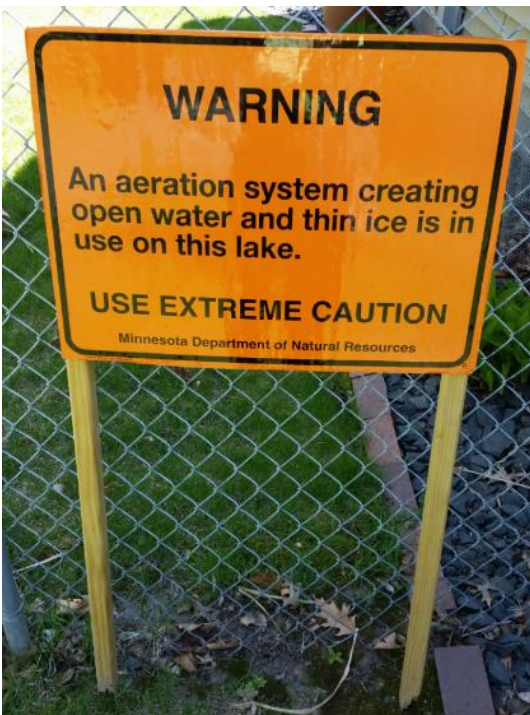
4 DNR Warning signs