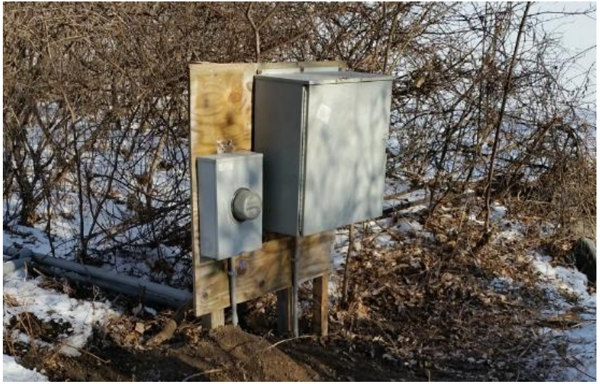
Aerator Power Panel and Meter site at 15573 91 st Ave (12/2017)